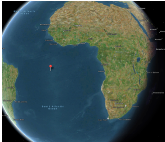
FIGURE 1 - SOUTH ATLANTIC OCEAN