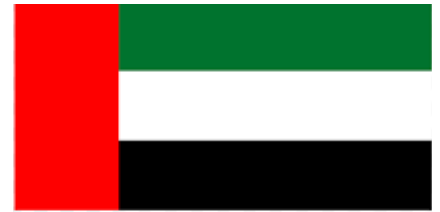
World Map: UAE